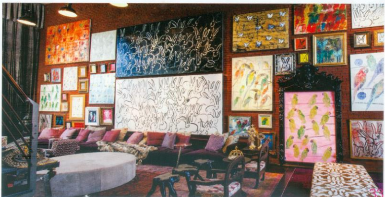
GP & J Baker