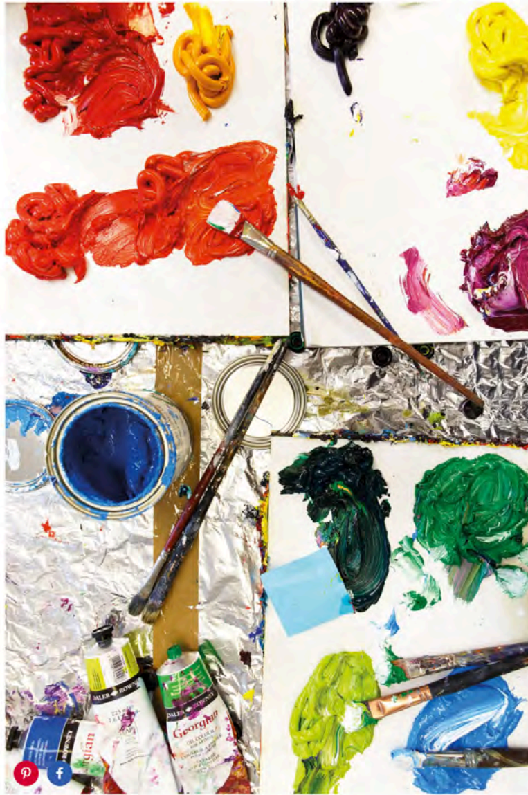
Photo: From Birds by Hunt Slonem, copyright © 2017, published by Glitterati Incorporated