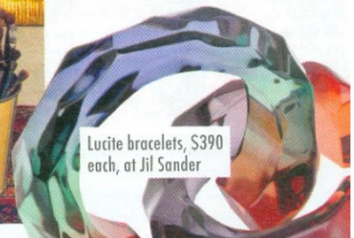
Lucite bracelets, $390 each, at Jil Sander

Eclectic, but never at the expense of taste; color, properly honed by fine design; objects that tell the story of a moment, while still hinting at the creative process behind them... These are the qualities of the gifts an artistic woman craves—trinkets that speak to her creative soul will surely find a permanent home on her palette.