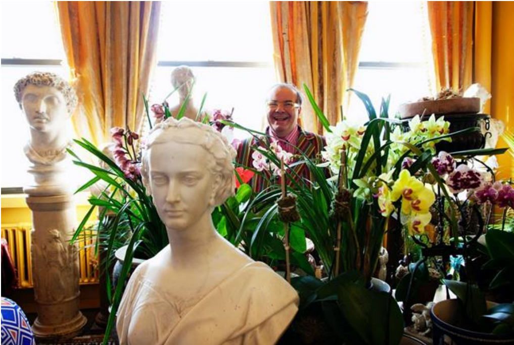
Hunt Slonem

Lorraine Rubio, Sunday, September 14, 2014