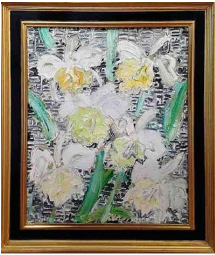
Hunt Slonem, Catelayas (2013)