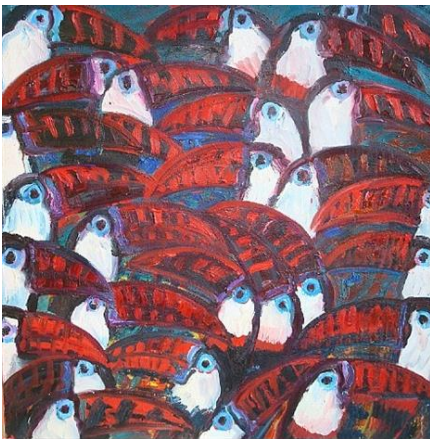
Hunt Slonem, Channel Bill (Toucans) (2008)

One of my favorite works of art is part of modernism, it's called The City Rises (1910) by Umberto Boccioni , the Italian Futurist painter. I've always loved that work. The city is such a fascinating thing and how it functions and rises, builds, and gets torn down and all the lights... [ The City Rises ] captures that divine manner of existence so beautifully. That's always fascinated me. There's artists I love and adore. I love Kiefer and a million artists. Picasso is my favorite, but as a single work [ The City Rises ] leads to an end as a single inspiration for me.